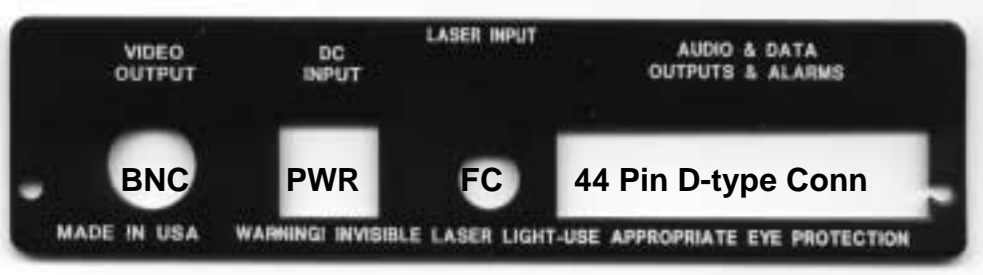
Rear Panel Receiver