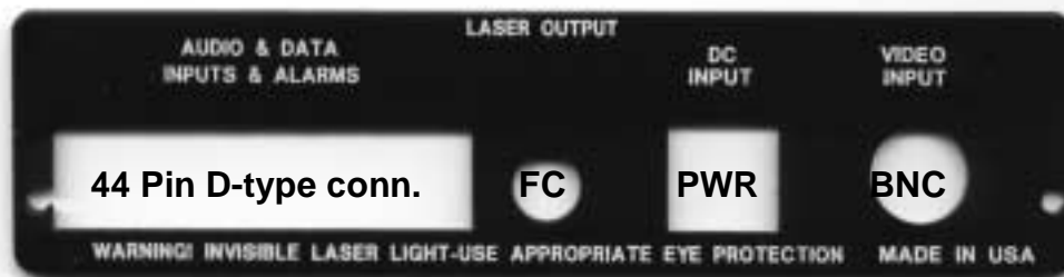
Rear Panel Transmitter