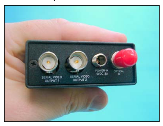
Small, Compact with Re-clocked, Loop-Through Input and Dual Re-clocked Outputs