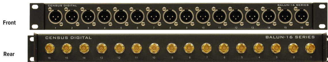
BALUN-16M Impedance Matching Panel 16 XLR Male to 16 BNC