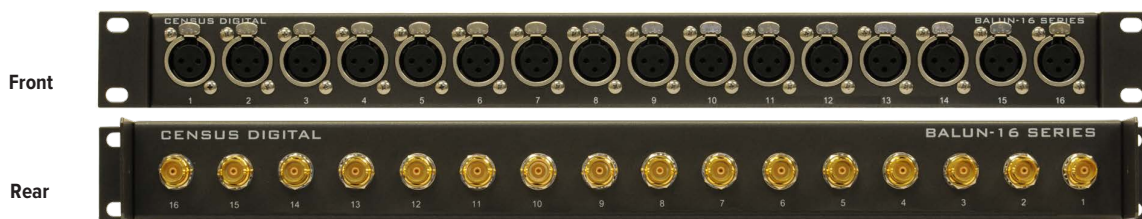
BALUN-16F Impedance Matching Panel 16 XLR Female to 16 BNC