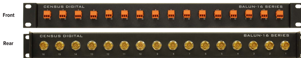
BALUN-16TB Impedance Matching Panel 16 Terminal Blocks to 16 BNC 1 RU