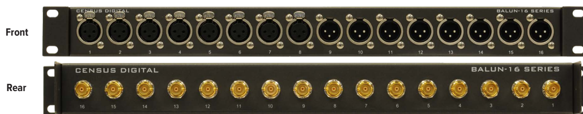
BALUN-8F8M Impedance Matching Panel 8 XLR Female + 8 XLR Male to 16 BNC