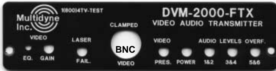
Front Panel Transmitter