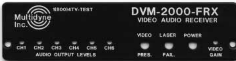
Front Panel Receiver