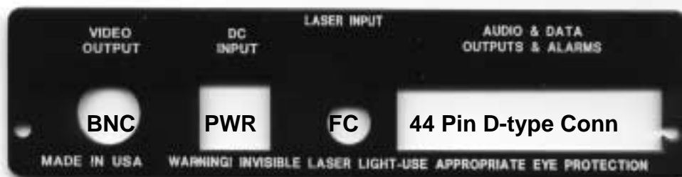
Rear Panel Receiver