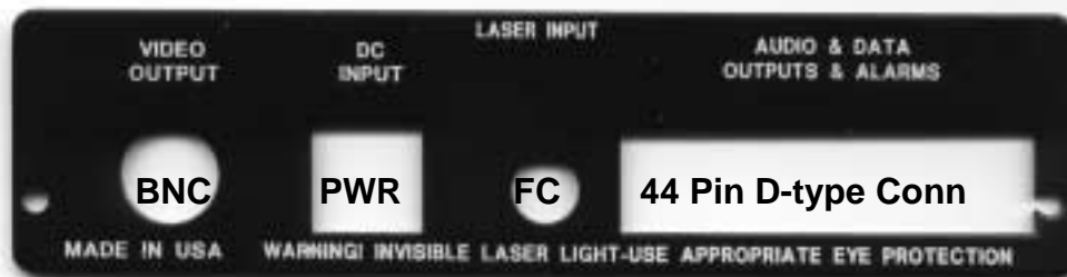
Rear Panel Receiver