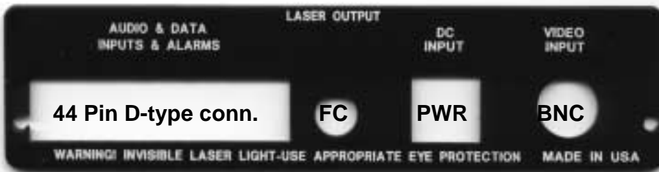
Rear Panel Transmitter