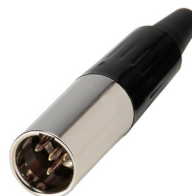
The BULLETS use industry standard, locking mini 4-pin XLR's for power. OA Power-Tap adapter is also available