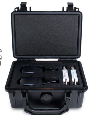
The case, power supplies and international AC plug adapters are all included

1-877-685-8439 1-516-671-7278 sales@multidyne.com