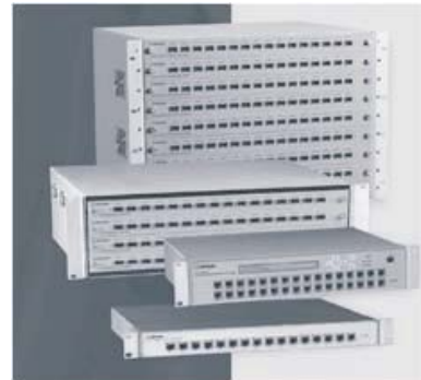
EOS-4000 in 16, 32, 64, 144 & 288 Chassis

Electro-Optical Routing Switcher for 4.25 Gbps Fiber Optic Video Transport