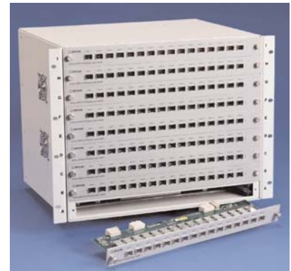
EOS-4144 144 by 144 Port Switch

The EOS4000 configuration commands are sent via a 10/100 Ethernet or RS232 connection using a simple intuitive command set. With regard to network testing, some of the most significant capabilities are: