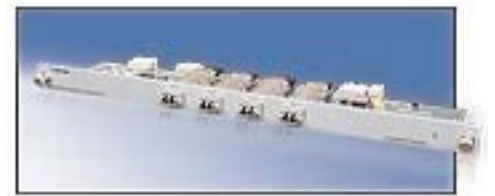
XFP Interface IO Blade for EOS Series with 4 XFP Ports at 10 Gbps