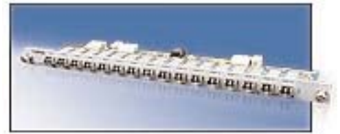
SFP Interface IO Blade for EOS Series with 16 SFP Ports at 4.25 Gbps