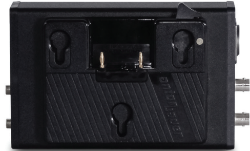
Battery Mount option Anton Bauer or V Lock