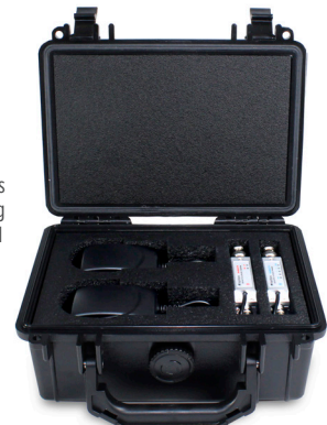
Specifications subject to change without notice

1-800-488-8378 1-516-671-7278 sales@multidyne.com