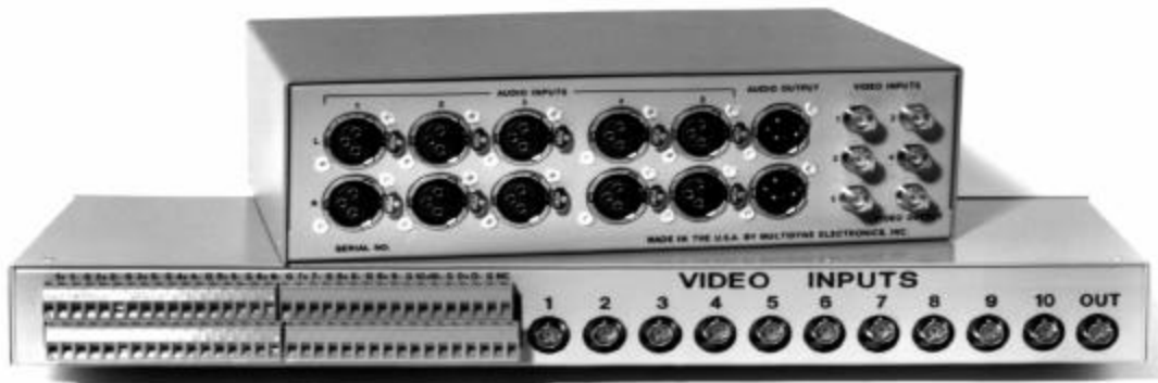
Rear View of SW-5S (top) and SW-10S (bottom)