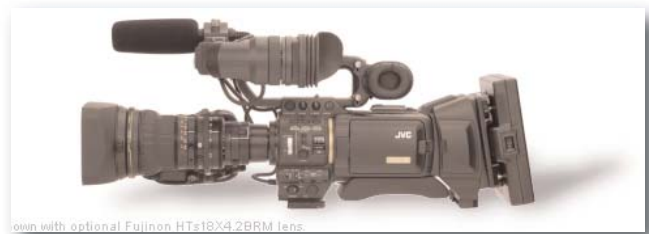
own with optional Fujinon HT18X4.2BRM lens